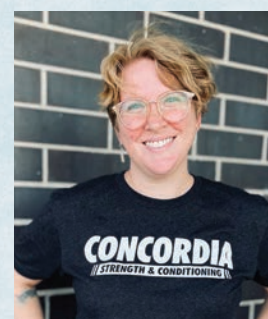
GRETE GIESEKE HIGH SCHOOL SPANISH