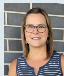
BECKY JESERITZ ACADEMIC SUCCESS CENTER