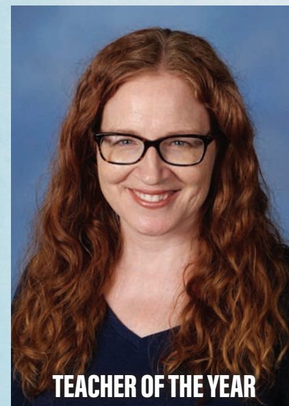
TEACHER OF THE YEAR