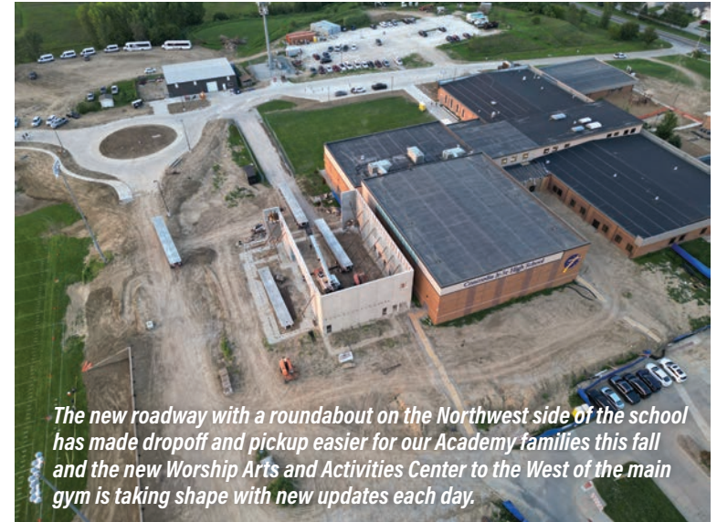
The new roadway with a roundabout on the Northwest side of the school has made dropoff and pickup easier for our Academy families this fall and the new Worship Arts and Activities Center to the West of the main gym is taking shape with new updates each day.

To initiate a conversation or for more details, please contact Nick Tofteland at nick.tofteland@concordiaomaha.org .